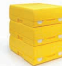
DINNER-MAX TEATIME Polysoft® boxes

Ultralight, sturdy, dishwasher-proof and stackable for a safe transportation