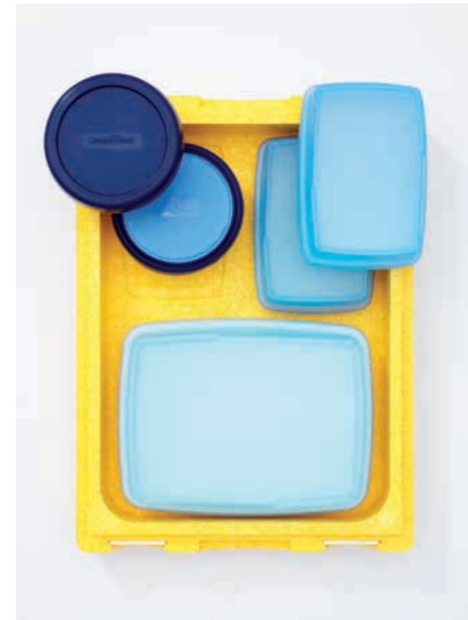
EXAMPLES OF USAGE

THE ALL-DAY MEAL SERVICE: Cake, breakfast, dinner, snacks and instant beverages