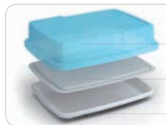
Cloche covering breakfast and cold dinner components

Ultralight, sturdy, dishwasher-proof and stackable for a safe transportation