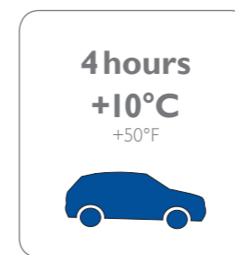
Delivered together with the lunch. Keeps cool for up to 4 hours.