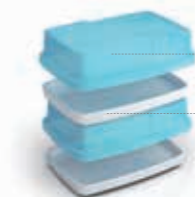
Porcelain plate and cloche for cake

Porcelain plate and cloche for snacks and light meals, instant beverages and single-serving products