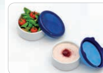
Left Porcelain bowl with silicone lid for salad

Porcelain plate and cloche for snacks and light meals, instant beverages and single-serving products